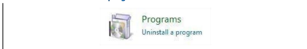
Figure 6. Control Panel – Uninstall a program